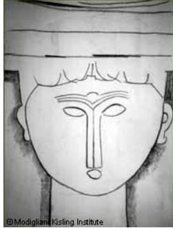
Drawings have been particularly targeted by fakers, who generally create new compositions "in the style of."